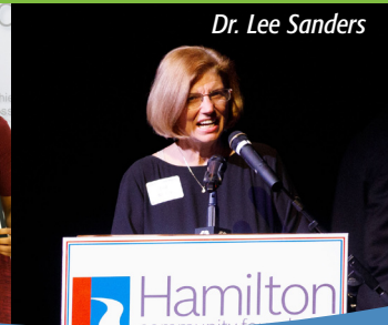
HCF Scholarship Reception page 3