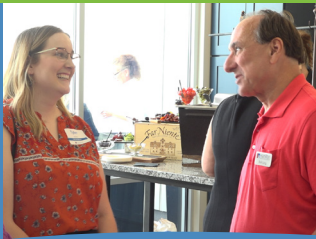
TAP Program Event cover story